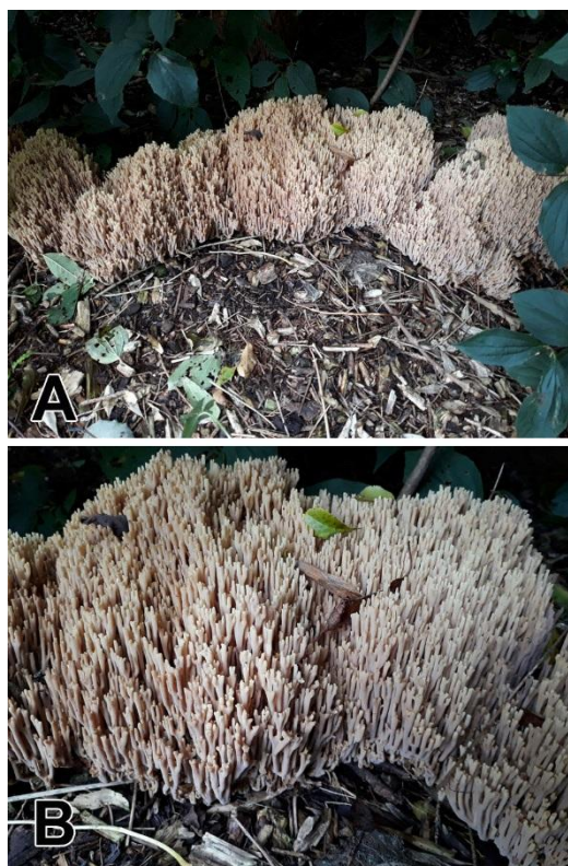
Fig. 2. Upright coral fungus ( Ramaria stricta ), Victoria Park, Glasgow, September 2017. (A) Large growth around 1 m long. (B) Close-up of growth around 10 - 15cm high.