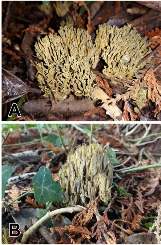
Fig. 3. Clumps of greening coral fungus ( Ramaria abietina ), around 5 cm high, on cypress leaf litter, Giffnock, Glasgow, October 2017.

Around ten clumps of R. abietina reappeared at the same location on 27th October 2017, and a single clump again on 17th November 2018. R. abietina material was also sent to Professor Roy Watling for confirmation.