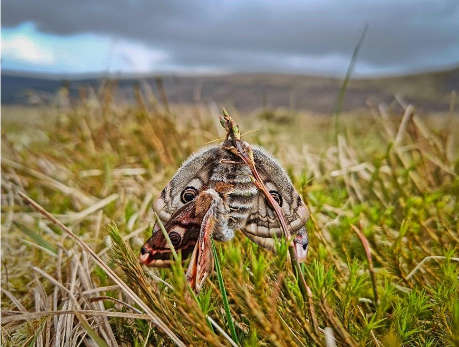
Mating emperor moths ( Saturnia pavonia), near Ben Shee, Glen Sherup Horseshoe Loop, Ochil Hills, Scotland, 7th May 2023.