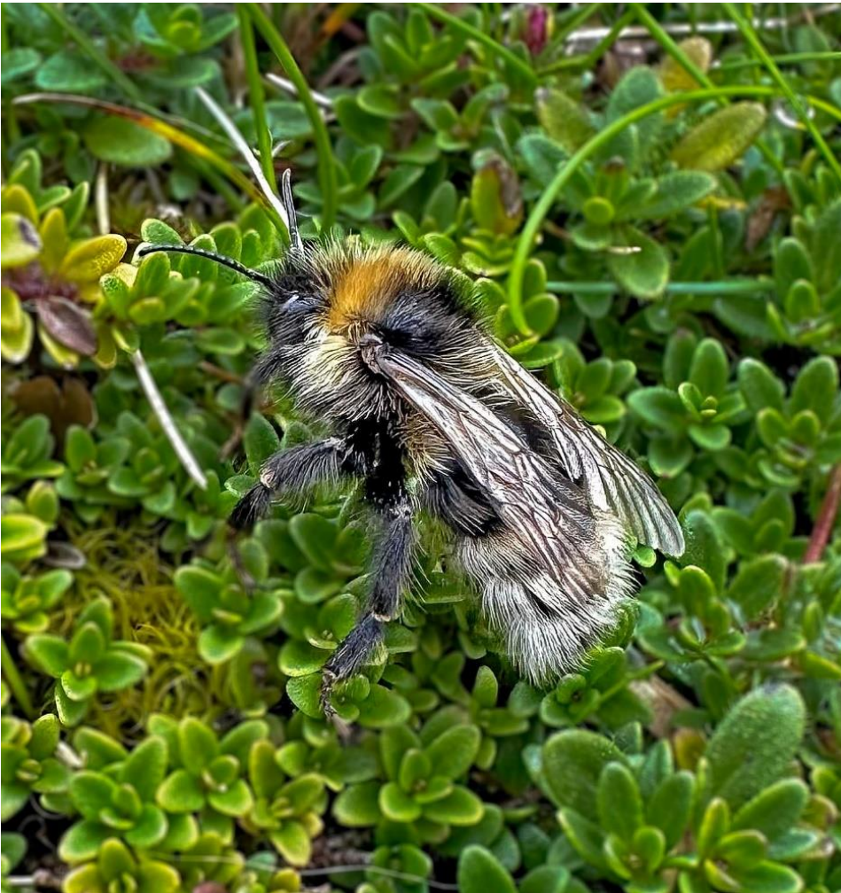
Male field cuckoo bumblebee ( Bombus campestris), North Ayrshire, Scotland, July 2023.