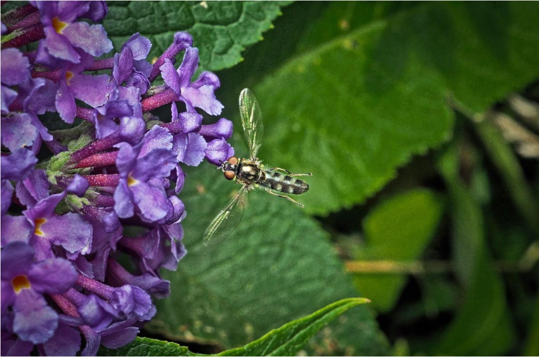
Ewan Parry - Hoverfly ( Platycheirus albimanus ), Leuchars, Fife, Scotland, 22nd July 2023.