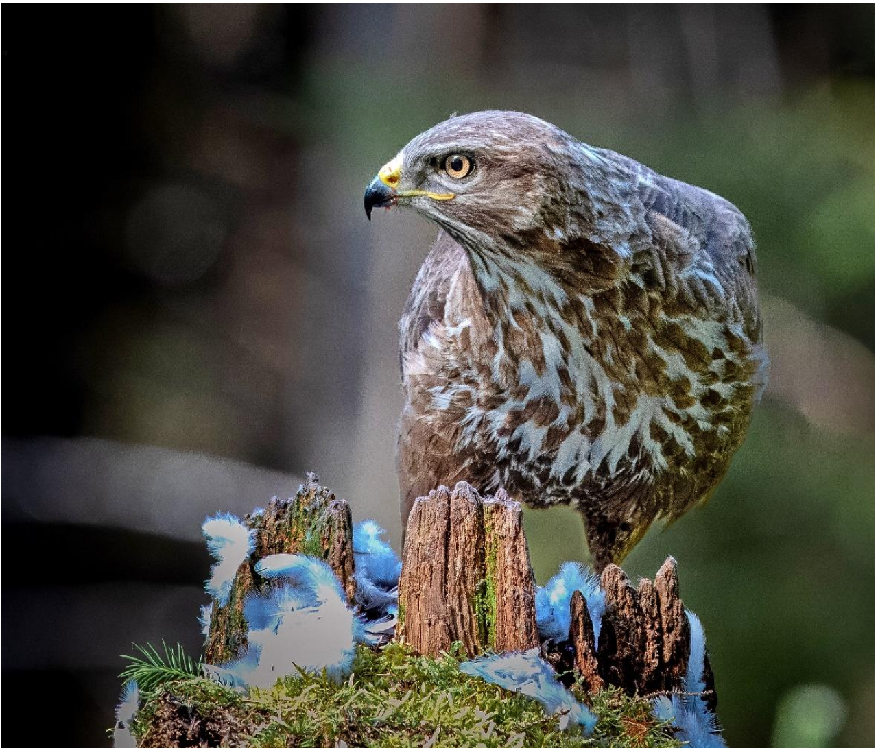
Common buzzard ( Buteo buteo), Forres, Scottish Highlands, 9th June 2023.