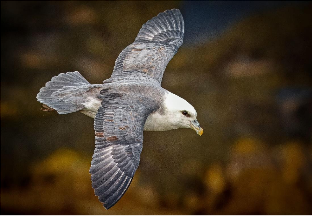
Fulmar ( Fulmarus glacialis), Covesea, Scottish Highlands, 26th March 2023.