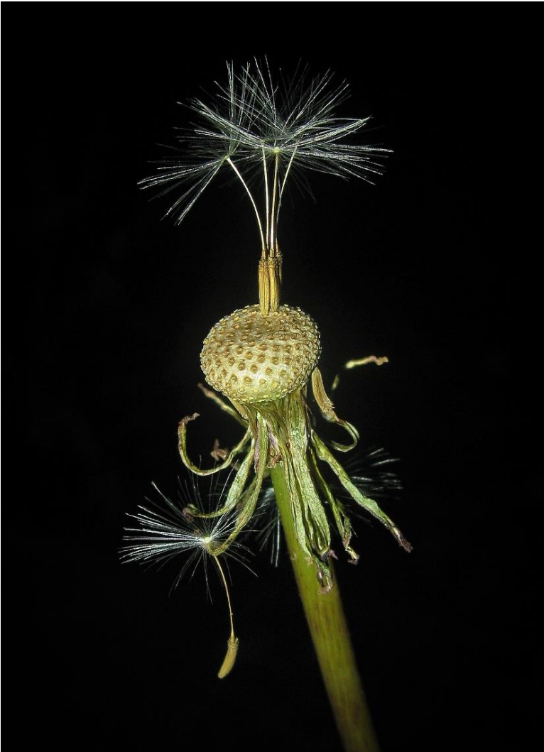
Sarah Longrigg - Dancing dandelion seeds ( Taraxacum sp.), Milngavie, East Dunbartonshire, Scotland, 10th June 2023.