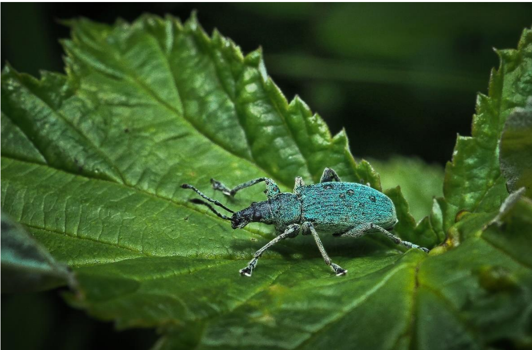
Ewan Parry - Nettle-weevil ( Phyllobius pomaceus ), Lochwinnoch RSPB Reserve, Renfrewshire, Scotland, 19th June 2022.