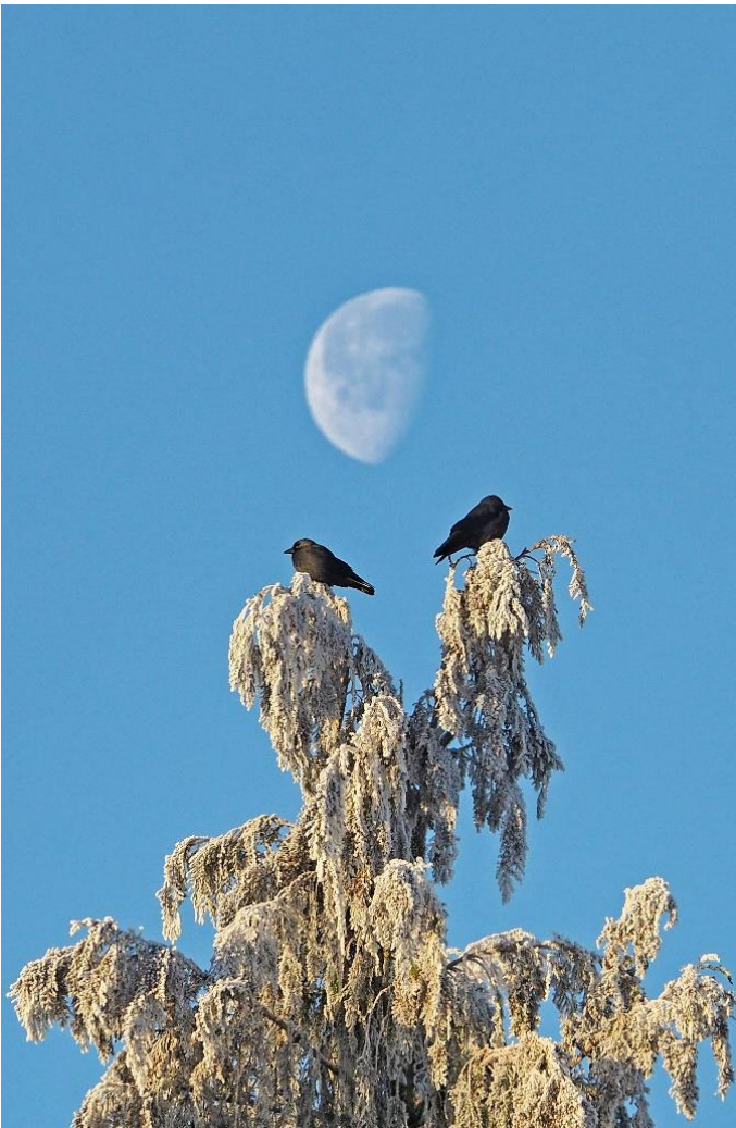
Ewan Parry - Jackdaws ( Coloeus monedula ), Garscube, Glasgow, Scotland, 14th December 2022.