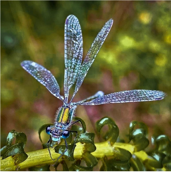
Emerald damselfly ( Lestes sponsa), Scottish Centre for Ecology and the Natural Environment, Rowardennan, Loch Lomond, Scotland, 14th September 2023.