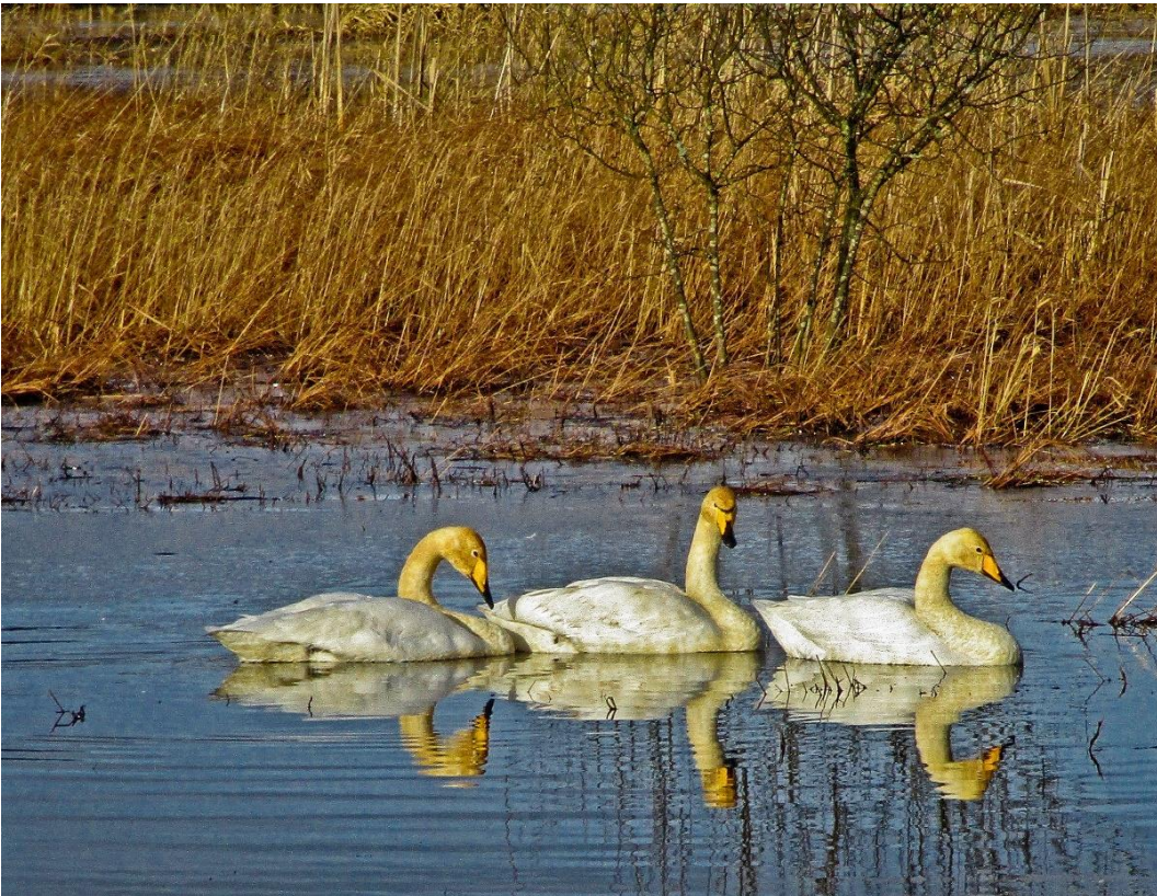
Pauline Wood - Whooper swans ( Cygnus cygnus ), RSPB Lochwinnoch, Renfrewshire, Scotland, February 2022.