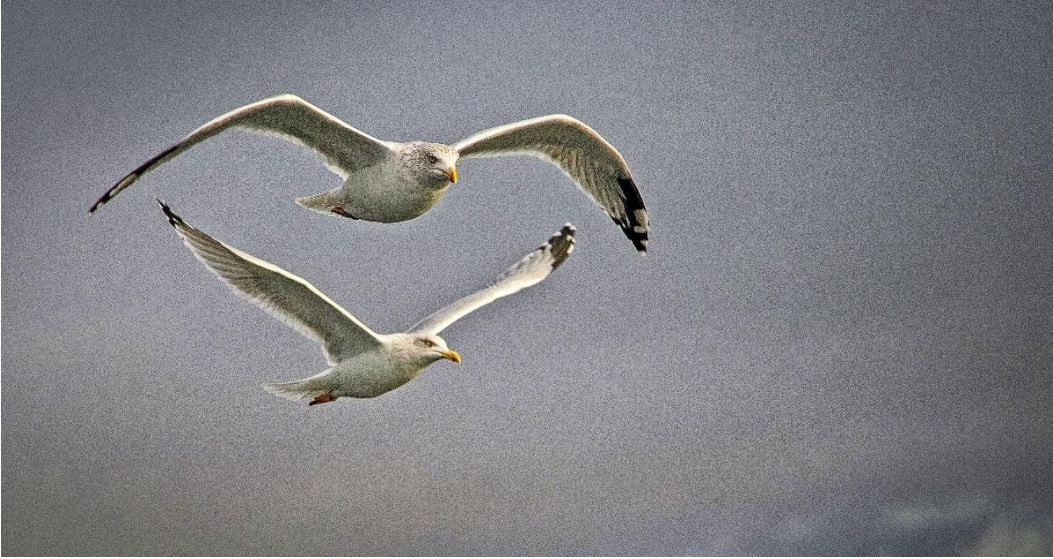
Adhip Aditya - Herring gull “heart” ( Larus argentatus ), Millport, Isle of Cumbrae, Scotland, October 2022.