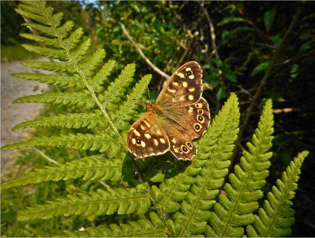
Richard Sutcliffe - Speckled wood butterfly ( Pararge aegeria ), Fife Coastal Path near Kirkcaldy, Scotland, 10th June 2023.